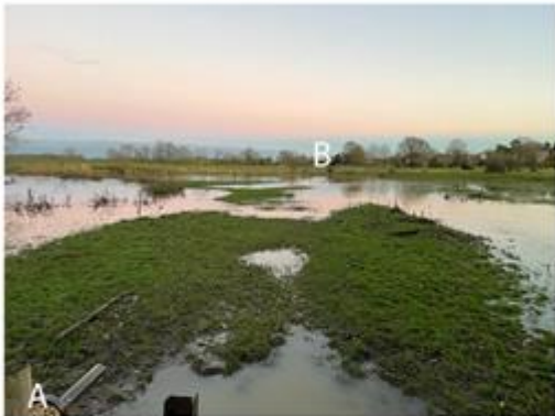
Monday, 11 December 2023 - Area of wetland viewed from footbridge near Riverside Road, Atherstone (A) towards Mill Lane, Witherley (B) frequently rendered impassable by flood water